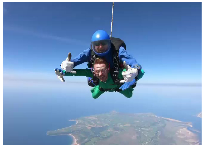
Burges Salmon trainee solicitors fundraising skydrive for Unseen